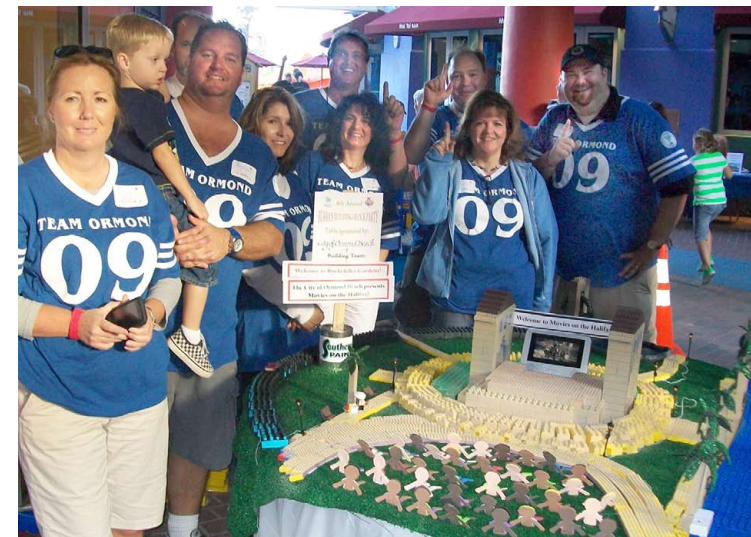
In 2009, the City of Ormond Beach won the “Forrest’s Favorite – Best in Show Award” for their replica of the Rockefeller Gardens.

Using colorful Mega block toys provided by Habitat for Humanity, plus any props you bring with you, your team will have fun creating your own structural masterpiece within three hours.