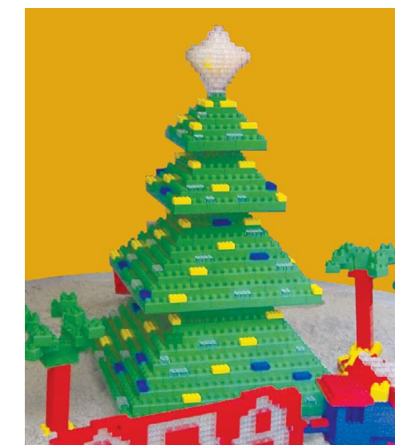
In 2009, Giles Electric sponsored the Alpha Omicron Alpha Honor Society team, who built a holiday scene.

It’s easy to join in on the building fun. Simply register your team, using the form found online. 🌱